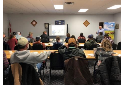
Winter Feed and Water workshop